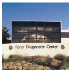
590 Eureka Avenue (6th and Wells)