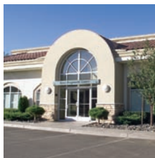
625 Sierra Rose Drive (SW Reno)

TWO LOCATIONS IN RENO, NEVADA TWICE THE EXPERTISE IN IMAGING